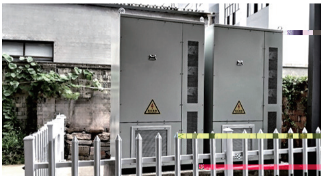
Figure 1: Project Photos