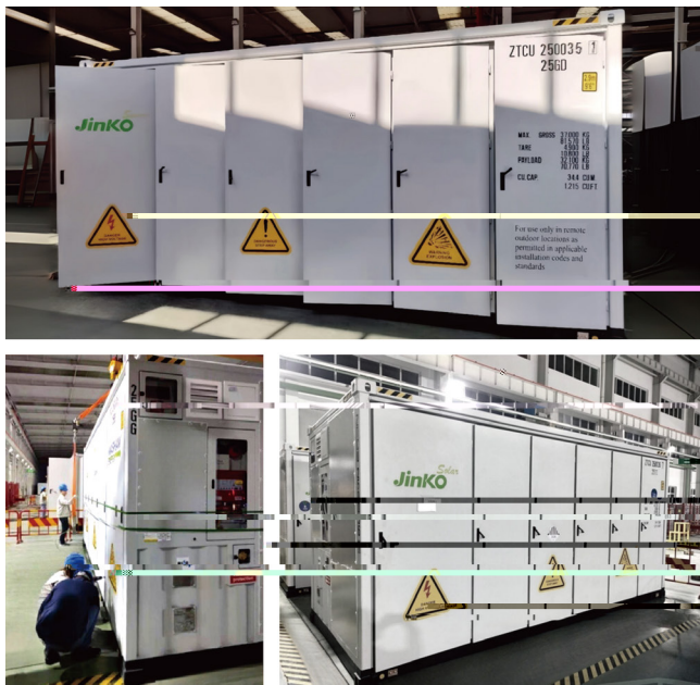
Figure 1: Project Photos

JinkoSolar today announced it has delivered a 10MWh of DC-side battery storage system to Israel. With this pre-installed high energy density ESS, which is scalable, controllable, and flexible, a high-resilient renewable generation system, peak shaving, and backup power are ensured.