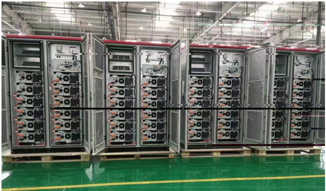
Figure 1: Project Photos

Located in 5 industrial parks, the 25 sets of JinkoSolar's SunGiga liquid cooling storage system (ESS) coupled with renewable energy contribute to grid stability. In addition, the high price of electricity during peak period in Guangdong Province brings a considerable amount of electricity expenses to enterprises, so these 5.375 MWh products play a key role in peak shaving and valley filling.